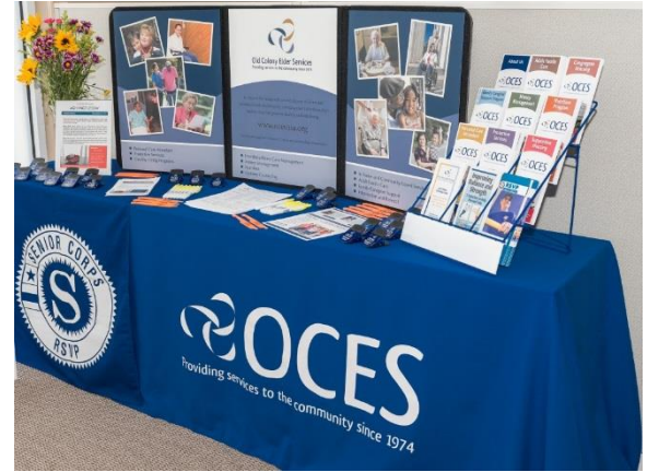
Volunteer Center is open Tuesday mornings and Wednesday afternoons.

Included in OCES' volunteer initiatives is the Retired and Senior Volunteer Program (RSVP) of Plymouth County, which is part of the Senior Corps network under the Corporation for National and Community Service, the federal agency for volunteering, service and civic engagement. OCES recruits people of all ages to volunteer for OCES as well as for other nonprofits, government agencies, schools and other organizations throughout Plymouth County.